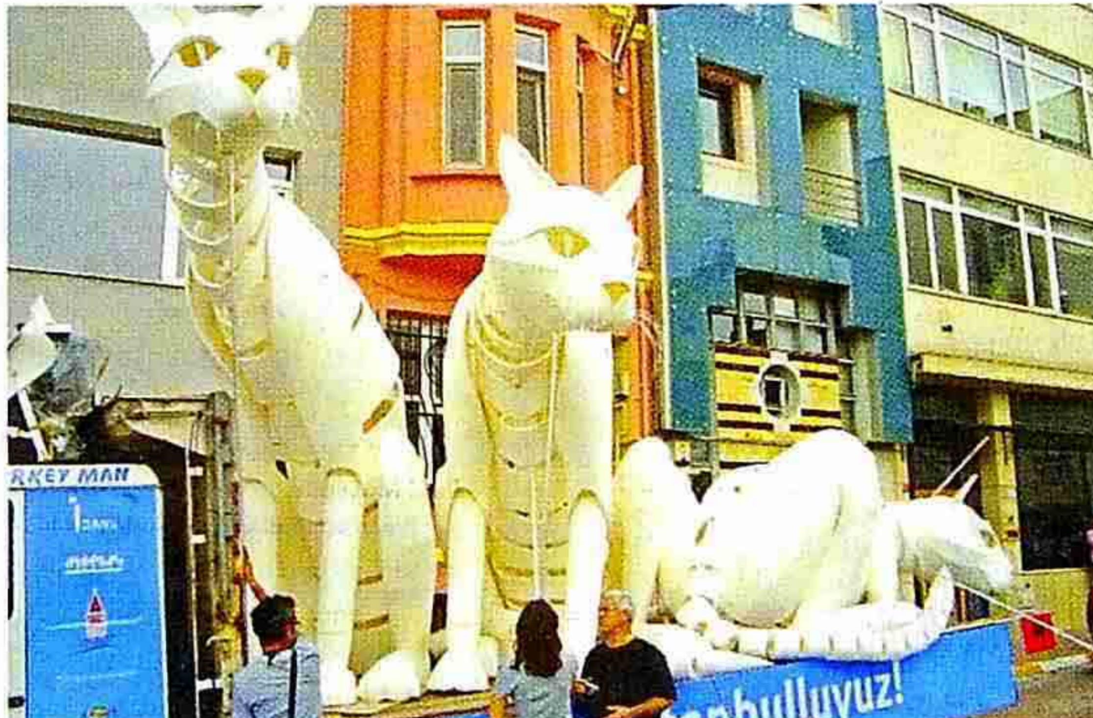
FESTIVAL: The iDANS Contemporary Dance and Performance will present 154 artists, 41 projects and more than 50 performances in various venues until the end of October. It will also continue with ad-

ing ceremonies of the recent FIFA World Cup, leads the design and supervises the creation of puppets of Istanbul's endemic animals. Large- and small-scale puppets will be created in designated neighborhoods with the local residents.